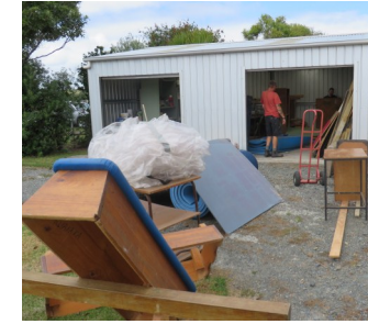
Dennis and James were busy today clearing out the shed ready for the first lot of bikes! Exciting stuff!