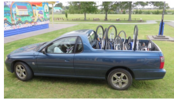
The first load of bikes have arrived.