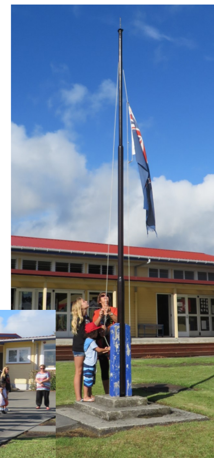
Singing the National Anthem and raising the flag for Waitangi Day

Welcome back to the 2015 school year. A special welcome goes out to the 15 new children that we have enrolled and their whanau. The powhiri we held last week is always a great way to start the year. We have started with 15 more children than we had at the same time last year so I am glad that we started our 9 th classroom. All class sizes are very manageable at this stage.