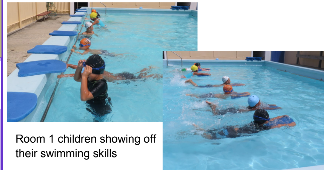
Room 1 children showing off their swimming skills

Most children are now swimming every day which is great. Today (Thursday) was the junior classes turn to show you what they have learnt in swimming so far this year.