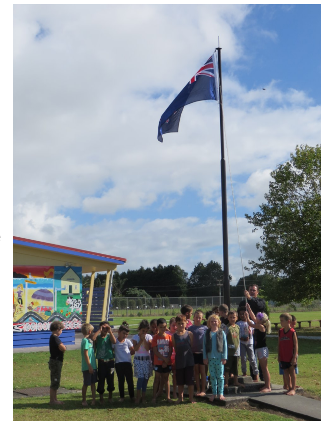
Room 7 raise the flag each morning.

SWIMMING – As the season changes and Autumn moves in, the water is getting cooler in the pool. We try to keep swimming going as long as the water temperature is around 20 degrees. Once it gets colder than that we will stop swimming. Your child's teacher will let the children know when there is no longer swimming – and sometimes the juniors will finish before the seniors.